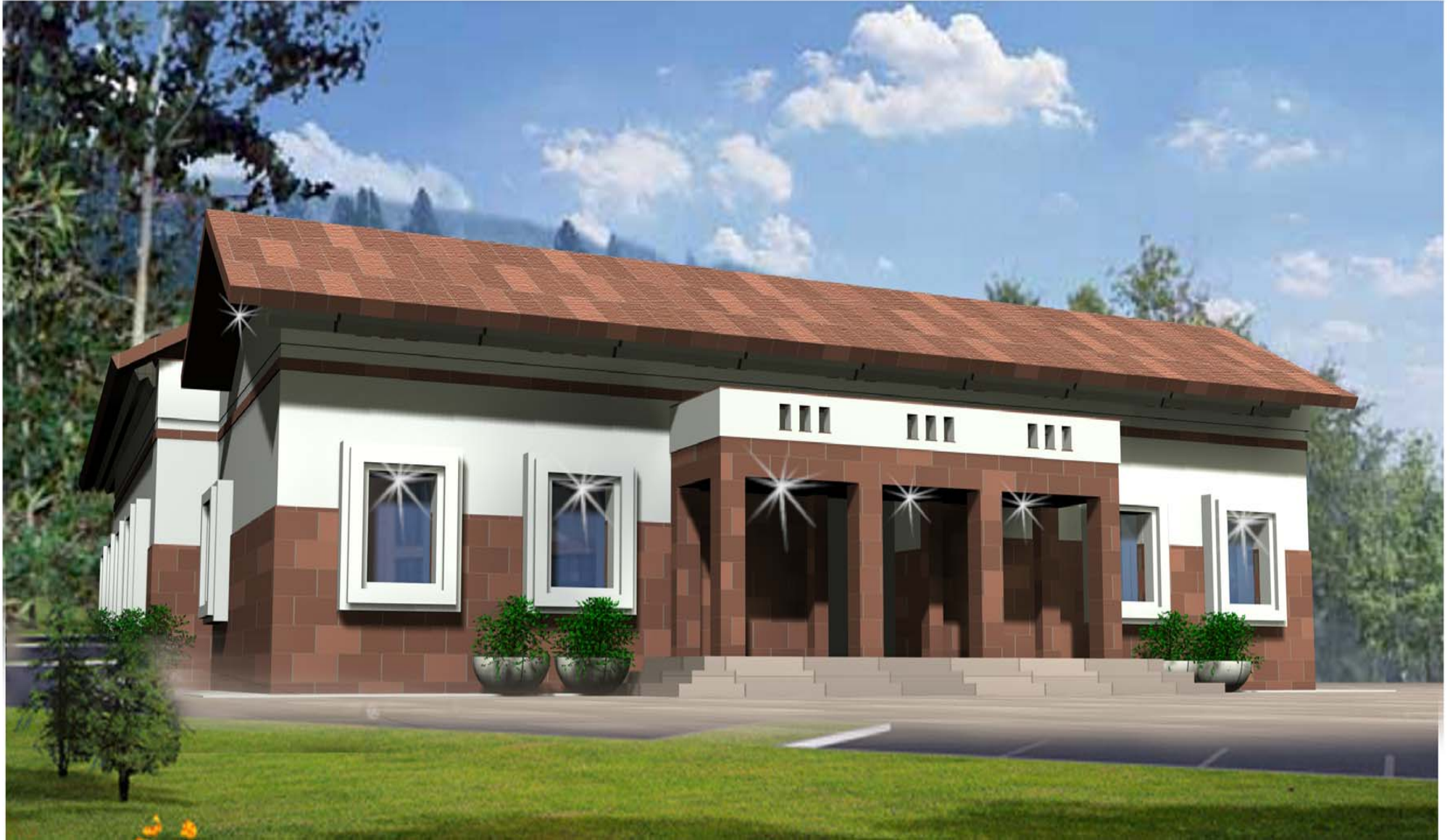
TYPICAL DESIGN - PRIMARY SCHOOL